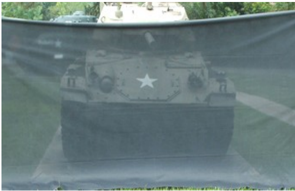
NOW YOU SEE IT.....