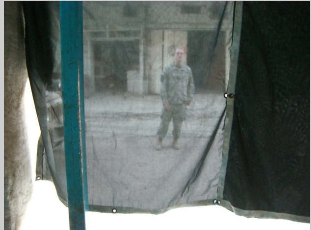
From the inside looking out. This is the same building. Notice you can still make out details, male vs female, in uniform, etc.

An evaluation of the PSV was done by US Army Military Police School (USAMPS), concluding results showed that the PSV is a very useful way of blocking the enemy's view of the valuable assets inside of a facility, while allowing the warfighter the capability of detecting and assessing targets on the exterior of the perimeter.