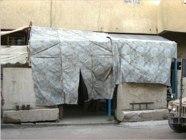
Perimeter Security Veil viewed from outside a building being protected. The building is in Iraq.