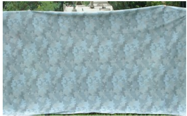
NOW YOU DON'T.....