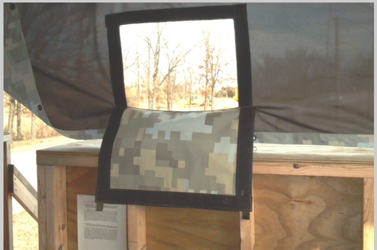
Velcro ports can be install in the field.

The PSV is available through GSA contract number GS-07F-9574S